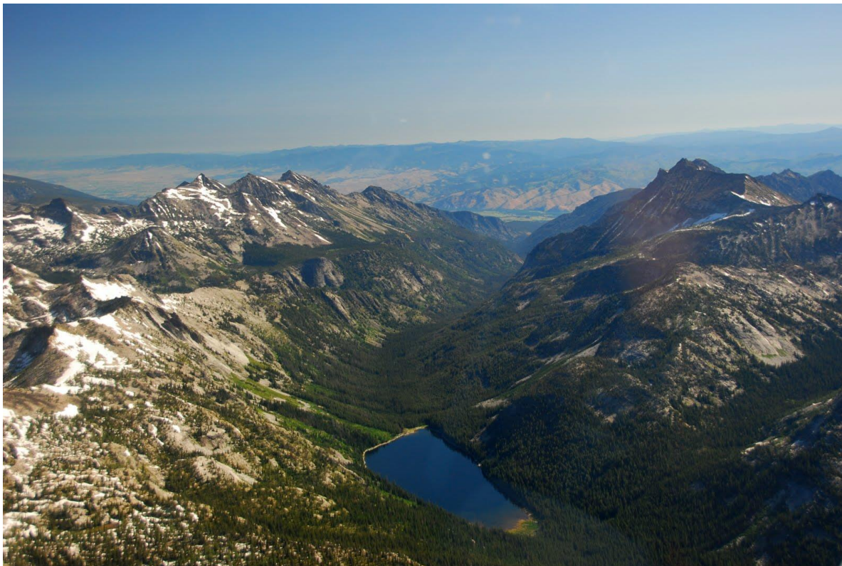
Figure 2.0 High glaciated mountains with alpine ridges and lower elevation lake basin. Photo taken above Tin Cup Lake, courtesy of M. Hoyt, 2011

The Bitterroot watershed is characterized by a wide valley and meandering river channel with riparian forest and floodplain. The watershed includes high, glaciated mountains with alpine ridges at higher elevations and glacial and lake basins at lower elevations. Elevations range from 10,131 feet at Trapper Peak in the Bitterroot Mountain Range to 3,120 feet on the valley floor.